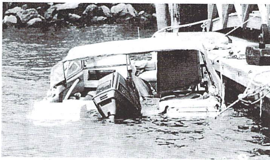
A casualty of Bertha was this small motor boat.

Harbormaster Don Beers said boatowners heeded the storm warnings last weekend when remnants of Hurricane Bertha blew southeast winds into town Saturday. Floats and boats were hauled out of the anchorage and only a couple of boats sank due to heavy rains. The storm hit at low tide preventing what could have been more damage, Beers said.